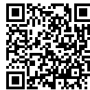
Download Coll8 on Google Play

If you haven't already registered on Legal & General's secure member website, Manage your Account, to access Coll8 you'll need your Pension Account Number (which is on your benefit statement) and an email address.